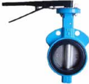
Fig. BW-1000 Series