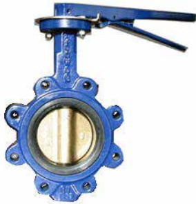
Figure: BL-1000 Series